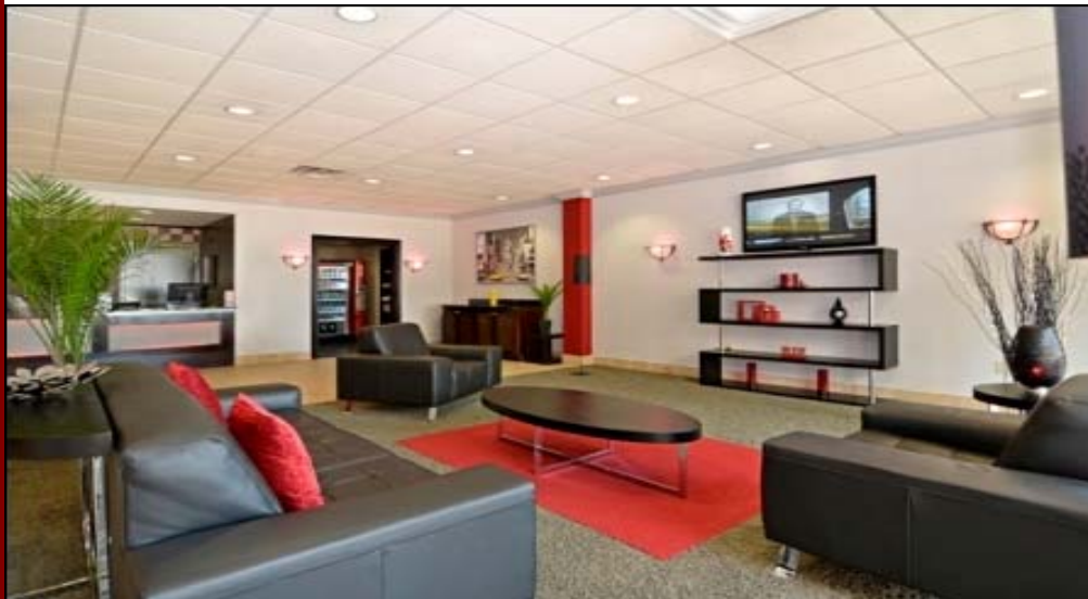
New Sitting Area