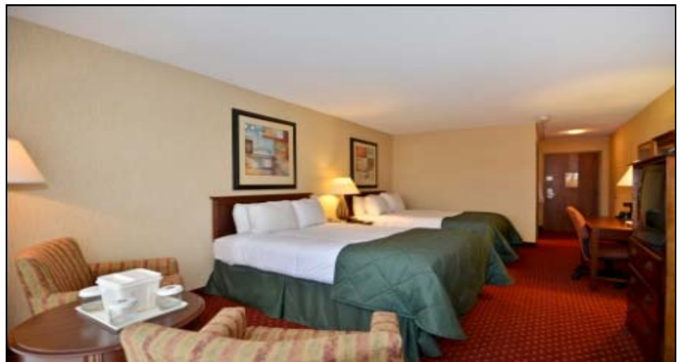
Updated Guest Rooms