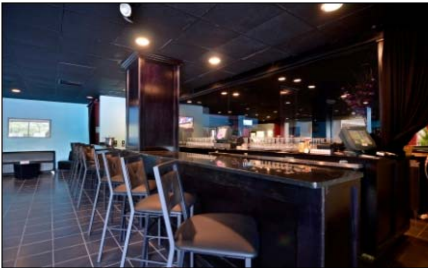
New Bar / Lounge