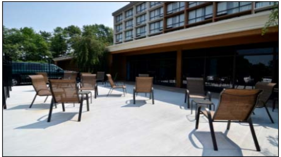
Outdoor Seating Area