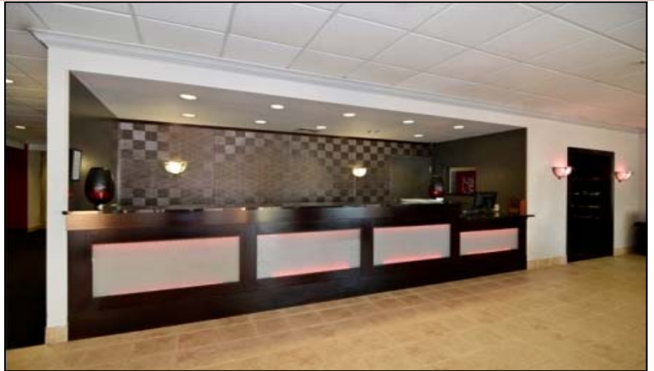
New Lobby Area