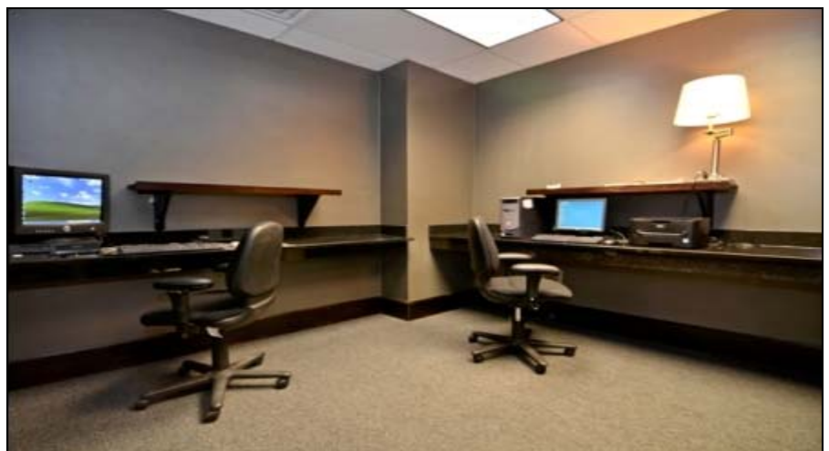
New Business Center