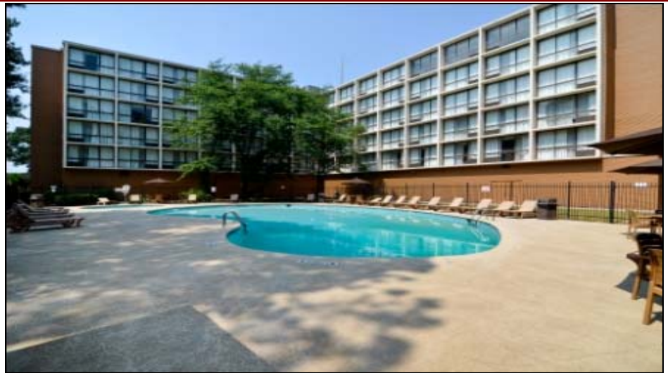
Beautiful Exterior Pool