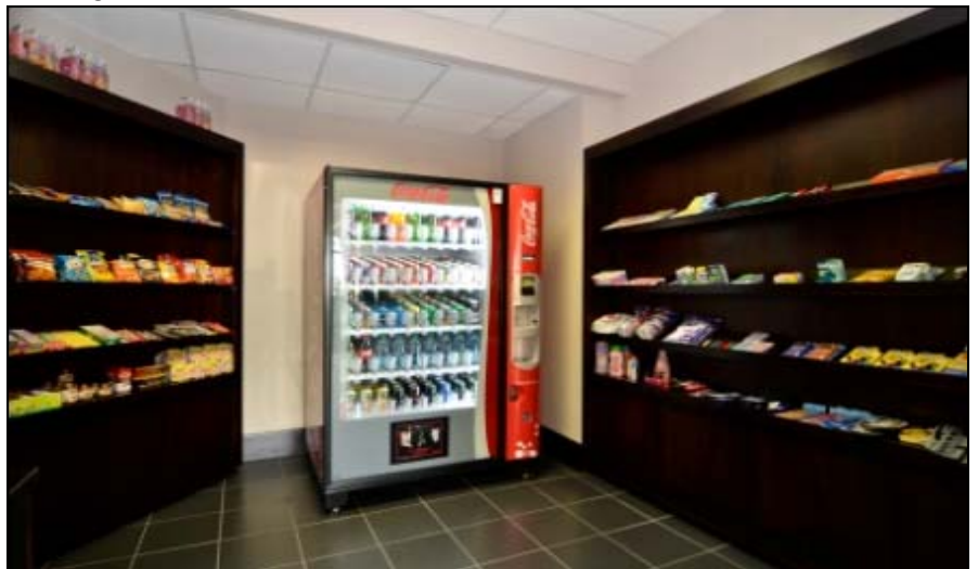
New Gift Shop