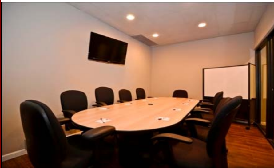
New Executive Meeting Room