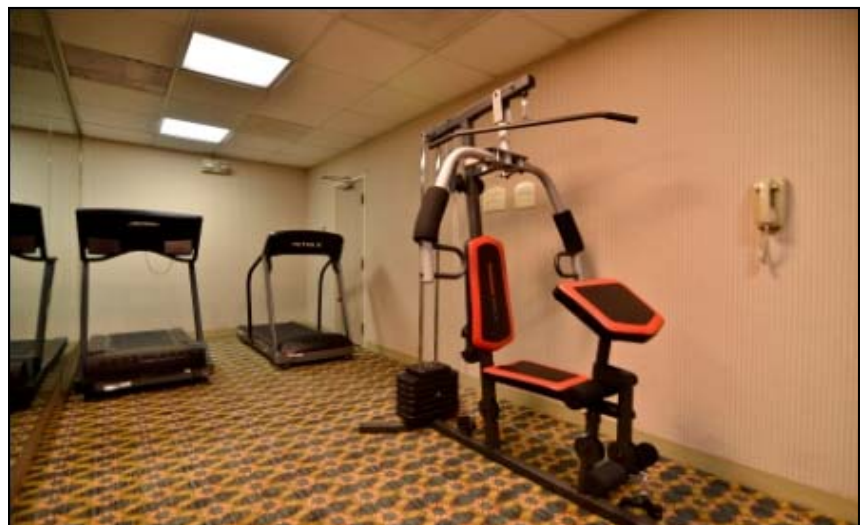
New Exercise Room