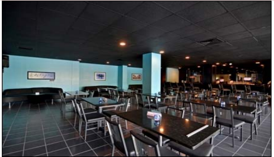
New jazz Club